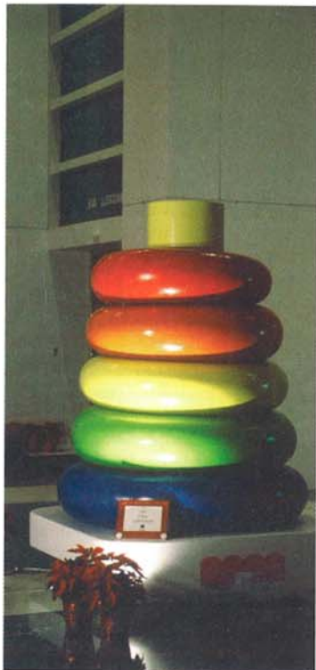
Last year's winner, by TSAO Design Group, top; RTKL's 2005 entry, above